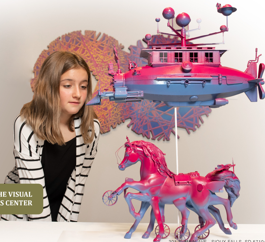
THE VISUAL ARTS CENTER

The Washington Pavilion is a private, 501(c)3 not-for-profit organization, serving the community through earned and contributed support.